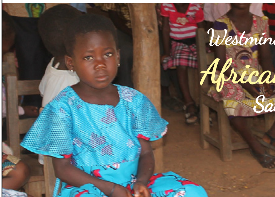
A young schoolgirl in Nyitawuta, HOCAP Mission-Ghana