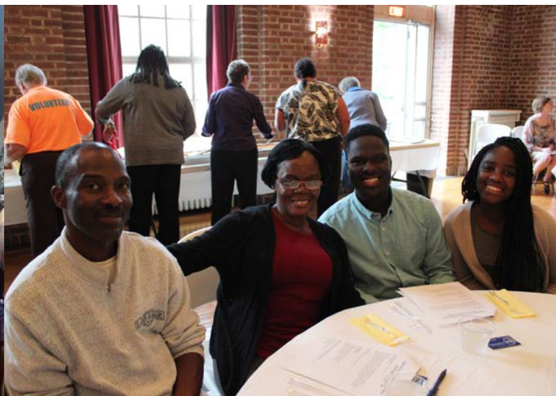
(l) Children presented Church School teachers with tokens of appreciation. (r) Church School June 2018