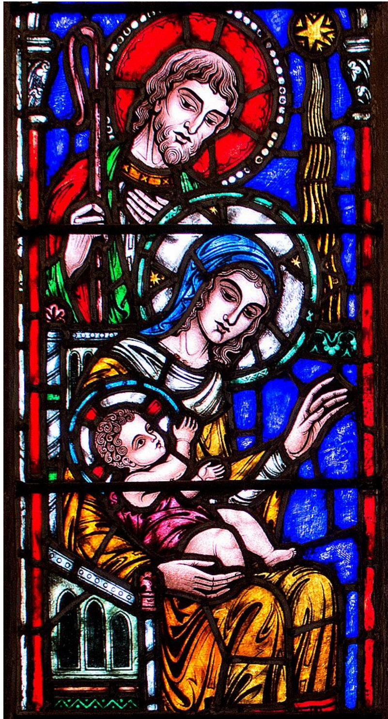
Westminster Presbyterian Church Albany, New York